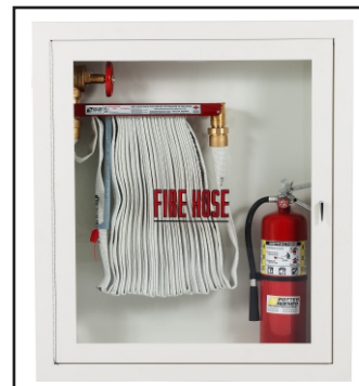
MODEL FRC1304-A (Shown)