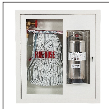
MODEL FRC1604-BA (Shown)