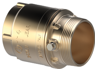
A140 - A140G