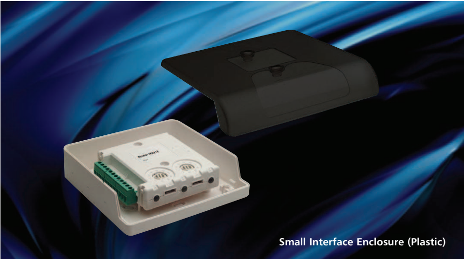
Small Interface Enclosure (Plastic)

The Vigilon Interfaces are generally supplied without enclosures. A range of enclosures are available if required to house them.