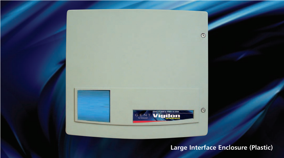
Large Interface Enclosure (Plastic)