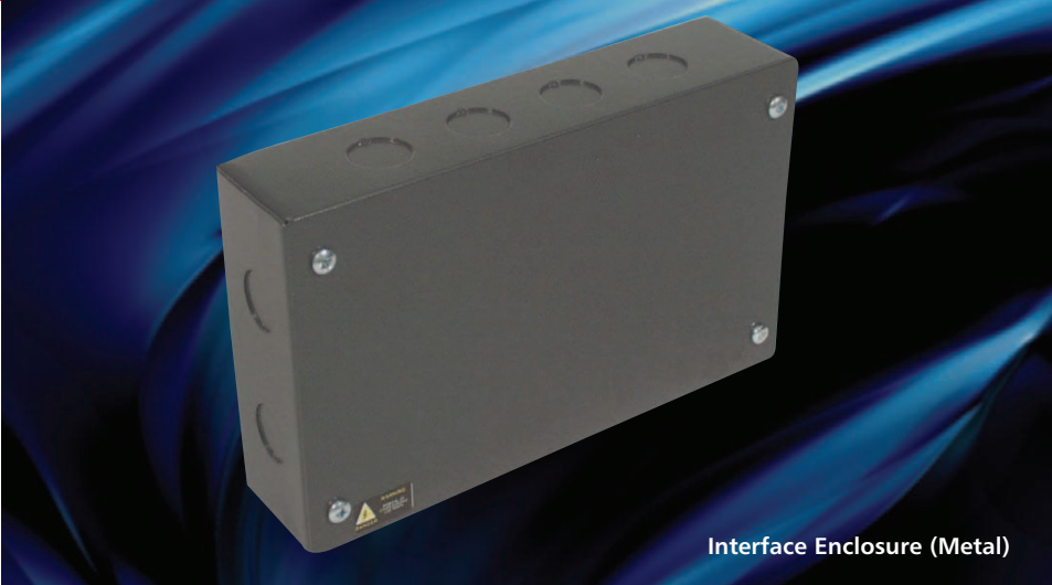
Interface Enclosure (Metal)